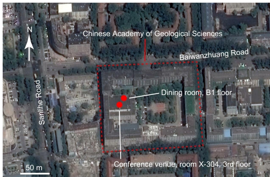
Fig. 1 Conference venue and dining room in the Chinese Academy of Geological Sciences (CAGS)

Fees: RMB 300/ USD 50 (conference) or RMB 1550/ USD 245 (conference and post-conference field trip). Conference material will be provided.